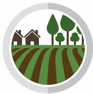
Urban agroforestry to address challenges of land tenure, health, food security, and unemployment