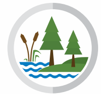
Constructing wetlands and restoring forest landscapes to support these ecosystems and conserve the services they provide