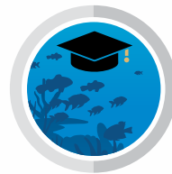
Establishing Educational Managed Marine Areas to encourage ownership by young people