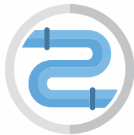
Combining natural and engineered infrastructure for water management