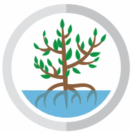
Rehabilitating mangroves to protect coastlines and biodiversity of islands